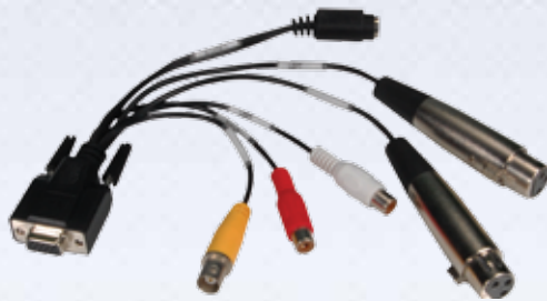
Input Breakout Cable