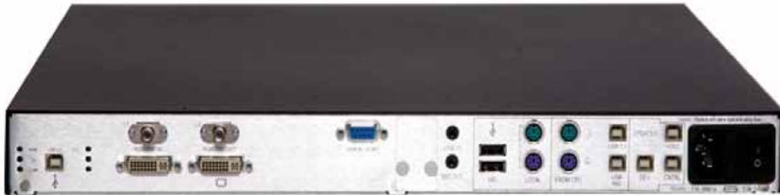
Velocitykvm Extender - 5 Transmitter, Multi-Mode