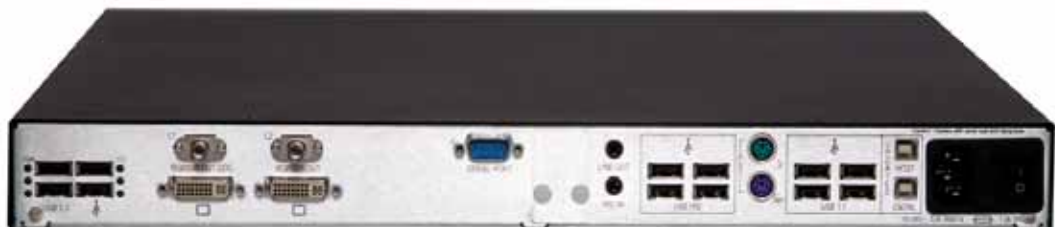
Velocitykvm Extender - 5 Receiver, Multi-Mode