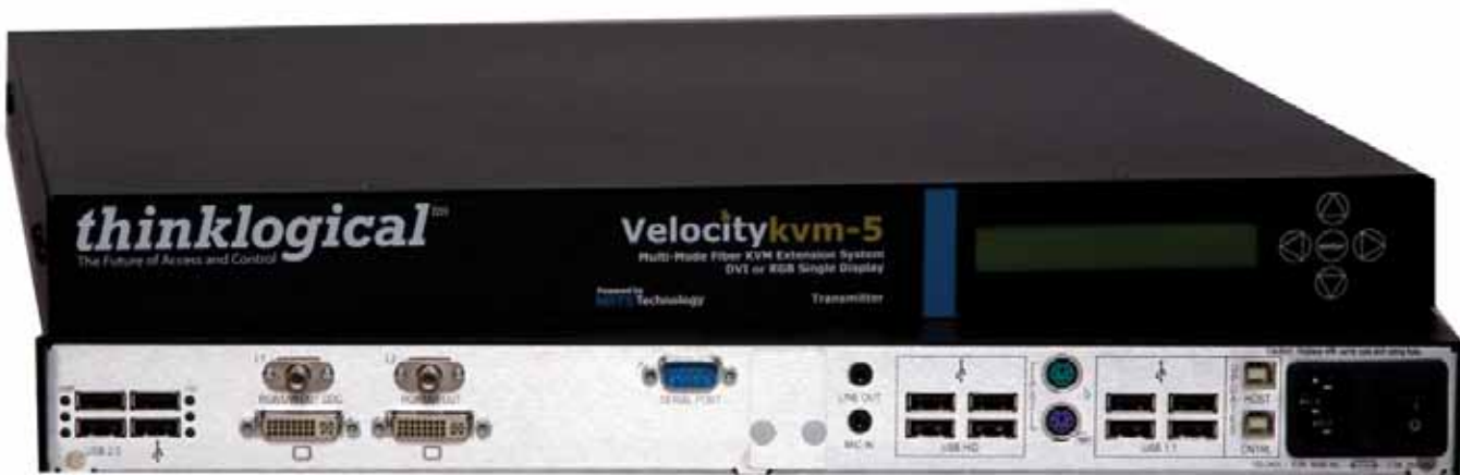
Velocitykvm System - 5, Transmitter and Receiver, Multi-Mode Fiber